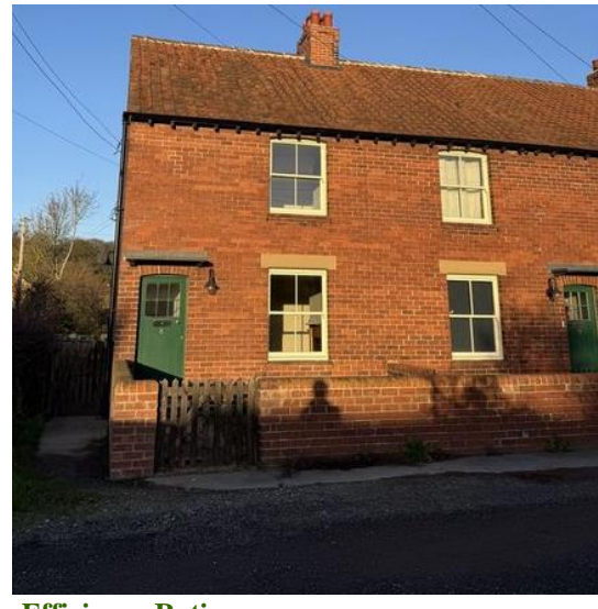
Energy Efficiency Rating

A deposit of £934 the equivalent of five weeks rent will be payable prior to commencement of the Tenancy and will be returned on termination, subject to all commitments having been met by the Tenant. The Tenant will be fully responsible for all other outgoings on the property.